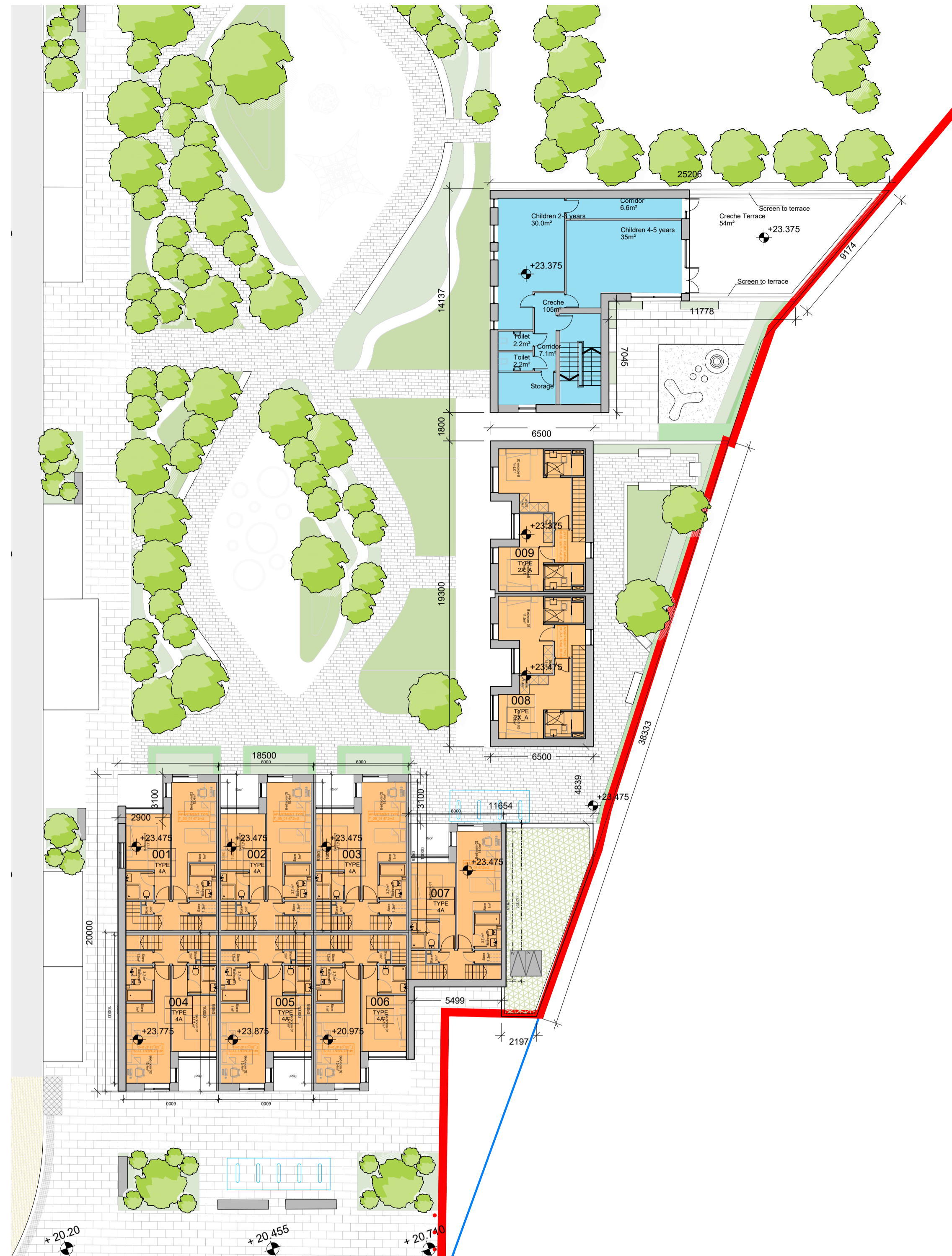
02 PW4 FIRST FLOOR PLAN PL1400 SCALE 1:200

NOTE ALL DIMENSIONS TO BE CHECKED ON SITE NO DIMENSIONS TO BE SCALED FROM THIS DRAWING THIS DRAWING IS TO BE READ IN CONJUNCTION WITH RELEVANT CONSULTANTS DRAWINGS